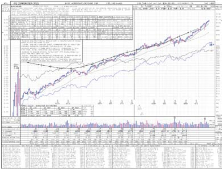
New colorized Datagraph

With two pages available, the second page can display our new colorized proprietary Datagraphs, or our colorized Daily Charts with either Top 10 or Accumulation/Distribution formats. We've taken meticulous care in creating clear crisp images to help you quickly review each stock. You can easily discern nuances in stock movement with the price/volume color coding.